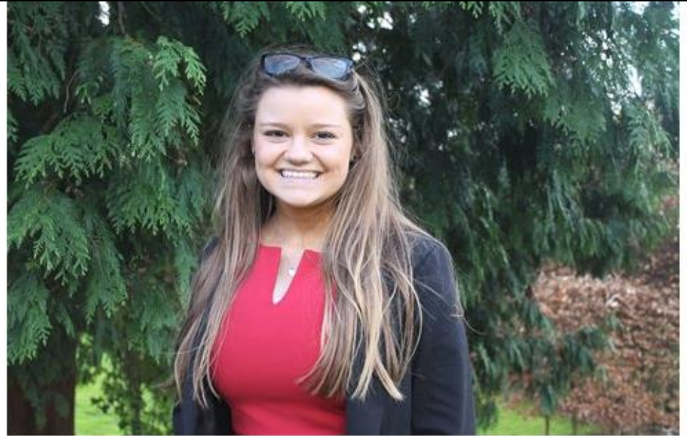
Autumn Beats Off The Competition To Land Prestigious Rolls Royce Commercial Apprenticeship